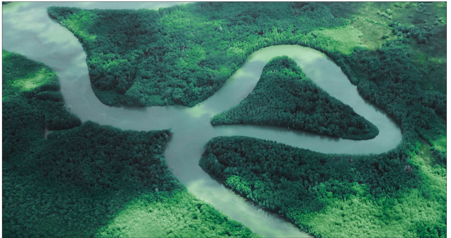
The treeclave in Freynz to delegate a new Woodward rerouted the Havenrun as a sort of protective moat.

Bloody coups over makeshift resource scarcity notwithstanding, the second arrival of Fancy Feast to the Imperial Crescent is sure to bring with it many good times, hard taffy, rides through the glass dome, and fascinating technology lectures from the outter planets like Negloa, Arris, and the wonderful mining giants of No'ad. Certainly theirs could come in handy as we try to dig for a solvent to treat the sodium polyacrylate from Vritra. This author, for sure, will be watching and waiting for the imminent arrival of Fancy Feast to Dragonsmaw -- you can be sure that the second coming of such a delectable treat will be met with trumpets, underground euchre tournaments, cotton candy infused with the dreams of small children, and the like. Rumors abound that Fancy Feast has already arrived and that people are lining up to buy. ■